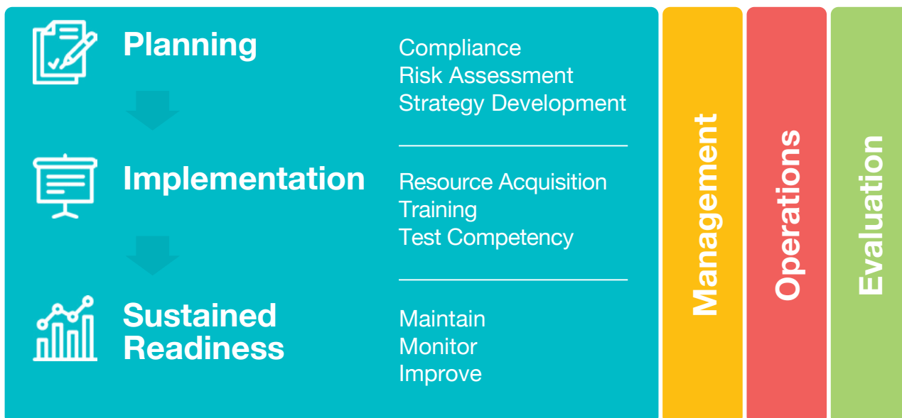
Figure 1 - Response Plan Readiness Basics

Three response readiness aspects common to the three project phases are (i) management, (ii) operation, and (iii) evaluation. Each of these aspects is equally important and a deficiency in one affects the overall adequacy of a response system.